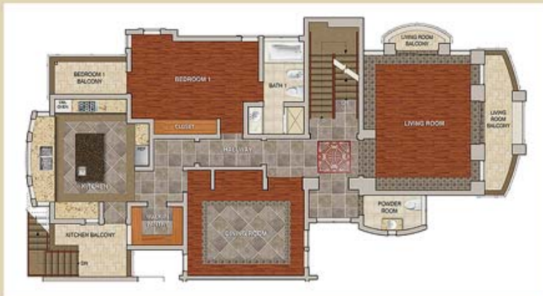
FIRST FLOOR Living Room - Dining Room - Powder Room - Bedroom 1 - Bath 1 - Kitchen - Balconies