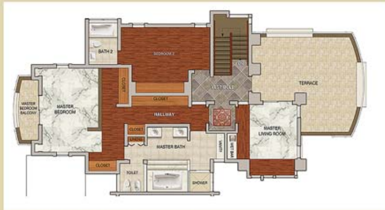
SECOND FLOOR Master Bedroom - Master Living Balcony Master Bath - Master Living Room - Terrace - Bedroom 2 - Bath 2