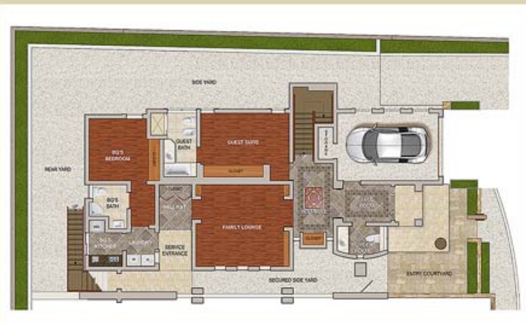
GROUND FLOOR Guest Suite - Guest Bath - Family Lounge - Powder Room - BQ's Bedroom & Bath - BQ's Kitchen Laundry Room - Attached Garage