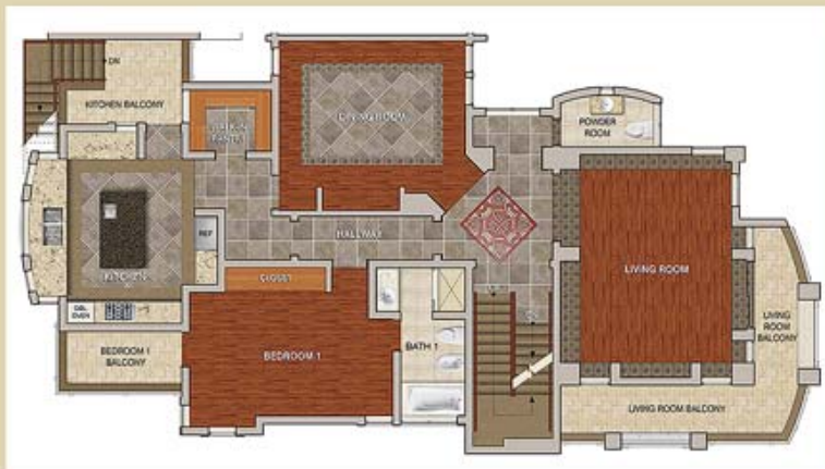
FIRST FLOOR Living Room - Dining Room - Powder Room - Bedroom 1 - Bath 1 - Kitchen - Balconies