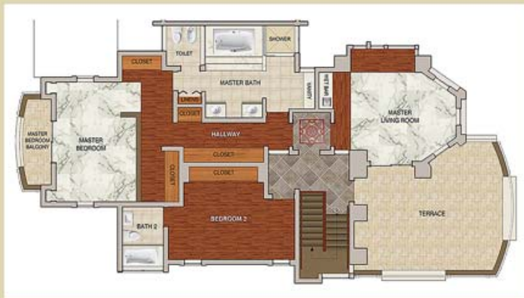
SECOND FLOOR Master Bedroom - Master Balcony Master Bath - Master Living Room - Terrace - Bedroom 2 Bath 2