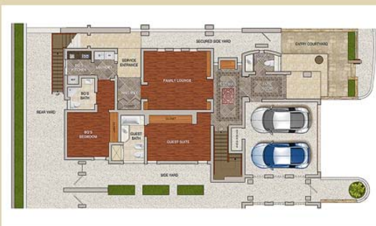
GROUND FLOOR Guest Suite - Guest Bath - Family Lounge - Powder Room - BQ's Bedroom & Bath - BQ's Kitchen Laundry Room - Attached Garage